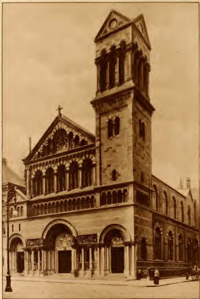
ST. BARTHOLOMEW CHURCH, Protestant Episcopal. Situated at 43rd Street and Madison Avenue.